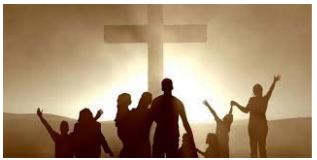
PARISH LIFE COMMITTEE

The purpose of the Parish Life Committee is to proclaim Jesus Christ to each other and to all the world by encouraging mutual care and fellowship within the congregation and presenting to the public a Christian image, which will reflect favorably on the work of Christ through this congregation.