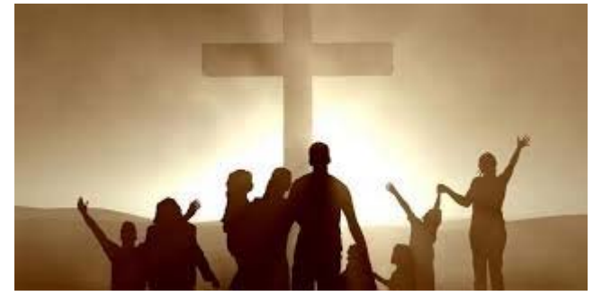
FINANCE ANNUAL REPORT

The purpose of the Finance Committee is to proclaim Jesus Christ to each other and to all the world by managing the financial resources of the congregation.