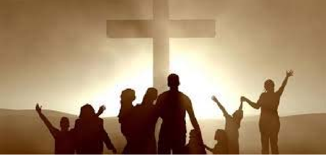
and to make Christ known