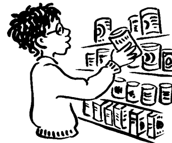
giving to people in need

Welcome to worship. Today is the second Sunday in Lent. During Lent, people get ready for Easter by: