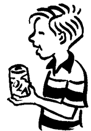
giving up a favorite thing