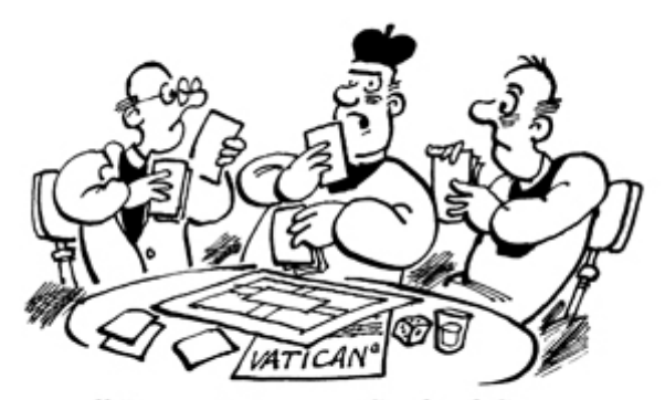
...well I suggest is was... Cardinal Crimson... in the Oratory with the rosary chain...

This is our anniversary month!!! Yes—we've been enjoying each other's company with no agenda (except good sportsmanship) for two whole years already!!! Time really does fly when you're having fun!!!