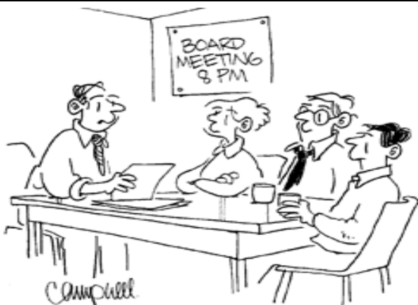
"The roofing contractor says we have to send a deposit. Filling in a pledge card isn't enough."