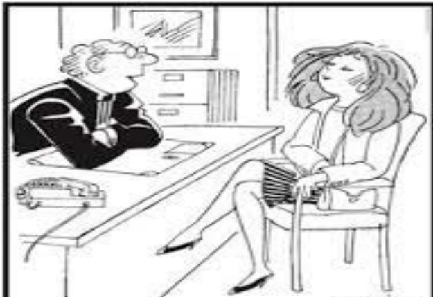
"That's Great! I don't know anyone else who gave up tanning salons for Lent!"