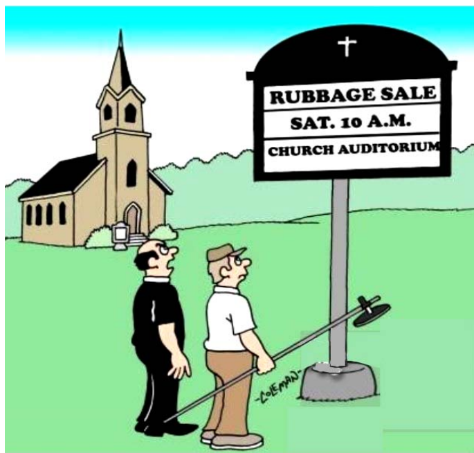
" THAT'S SUPPOSED TO SAY ' RUMMAGE SALE ' ..."