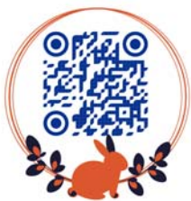
March “Lion” QR Code