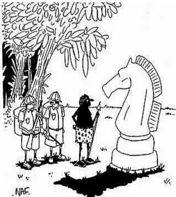
"Apparently, this is a good sign. He says 'big game' is near."