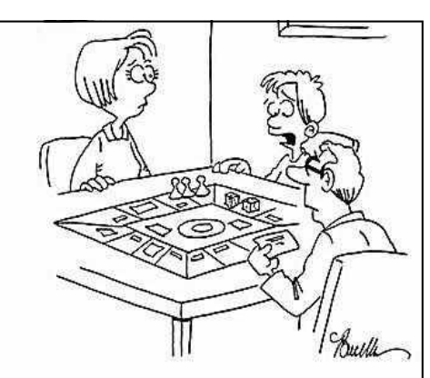
"If there's no controller, how do you move the dice?"

Is this the scene at your house when it's time to play games? Bring everyone down and remember what real fun is!!!