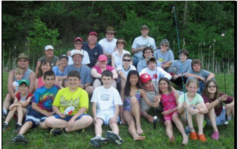
Fishing Derby 2012