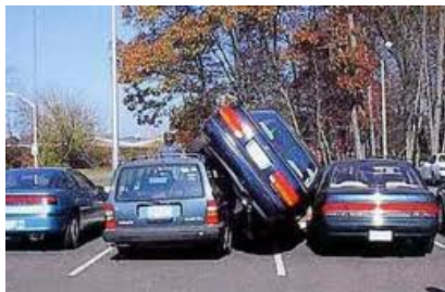
Spaces # 35, 35 1/2, 36

A few years ago we had quite a few spots available in our parking lots, but these days almost every numbered spot is rented, yes even the ones along the north side of the building.