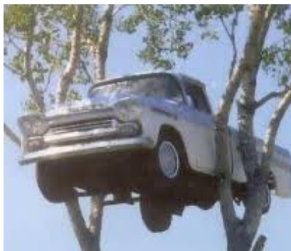
Space #47 Upper Level

What persons can do when coming to the church midday during the week is park along the curb on the south and west sides of our block, where there are no restricting signs, and in St. Mark's Place (along the north side of the building) in the area where there are no stripes and numbers near the choir door.