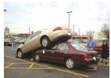
Spaces # 12A & 12B

There are also several spots marked "visitor" near the playground that may be available. Please do not park in any of the numbered spots during weekday daytime; the persons who have rented the spots become rightfully annoyed.