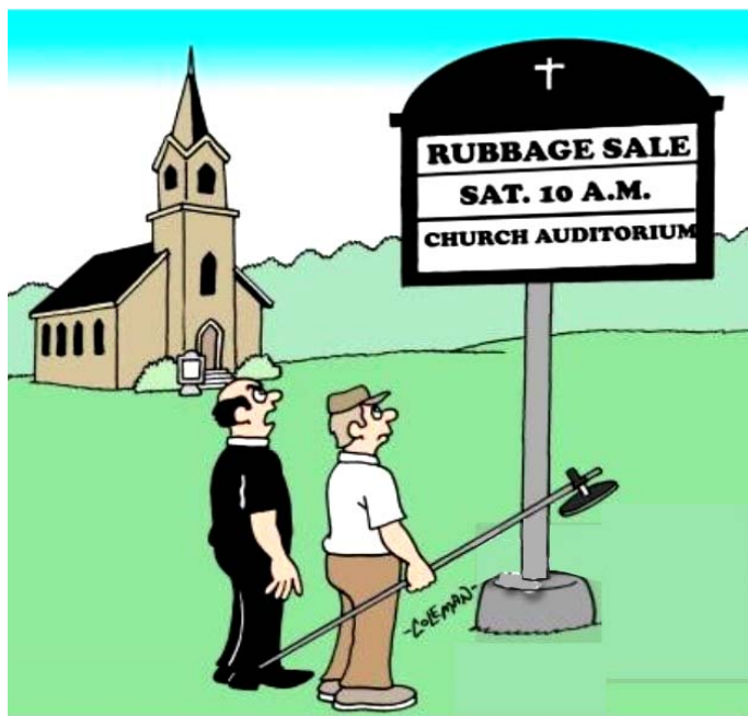
" THAT'S SUPPOSED TO SAY ' RUMMAGE SALE ' ..."