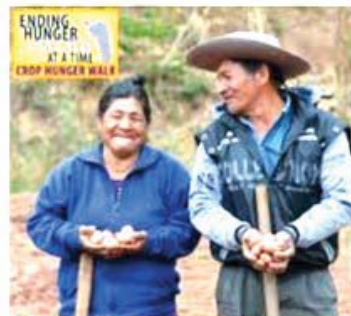
Walk. Give. Change the world.

The initial report from our CROP Walk Treasurers is that our county walks have collected well over $10,000 and they are still counting. These funds will help fight hunger & poverty around the world and respond to disaster. Remaining CROP envelopes should be brought to United Churches office as soon as possible.