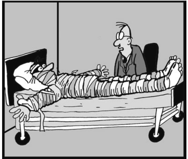
"The first day is always the hardest Claude... which Sunday School class were you teaching?"