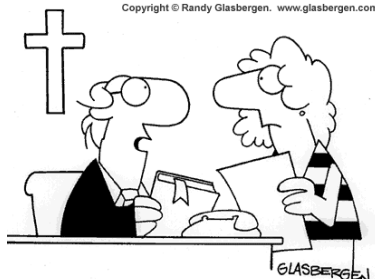
"I wasn't always as religious as I am now. For years I thought the Ten Commandments were a doo-wop group from the 1950's!"

Of course if there is anything else that you would like to see in the "Lion", let me know and we will see if we can work on it.